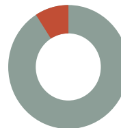
STATEMENT OF FUNCTIONAL EXPENSES 2022

TOTAL ASSETS $170,227,885 TOTAL LIABILITY $16,929,490 TOTAL NET ASSETS $153,298,395